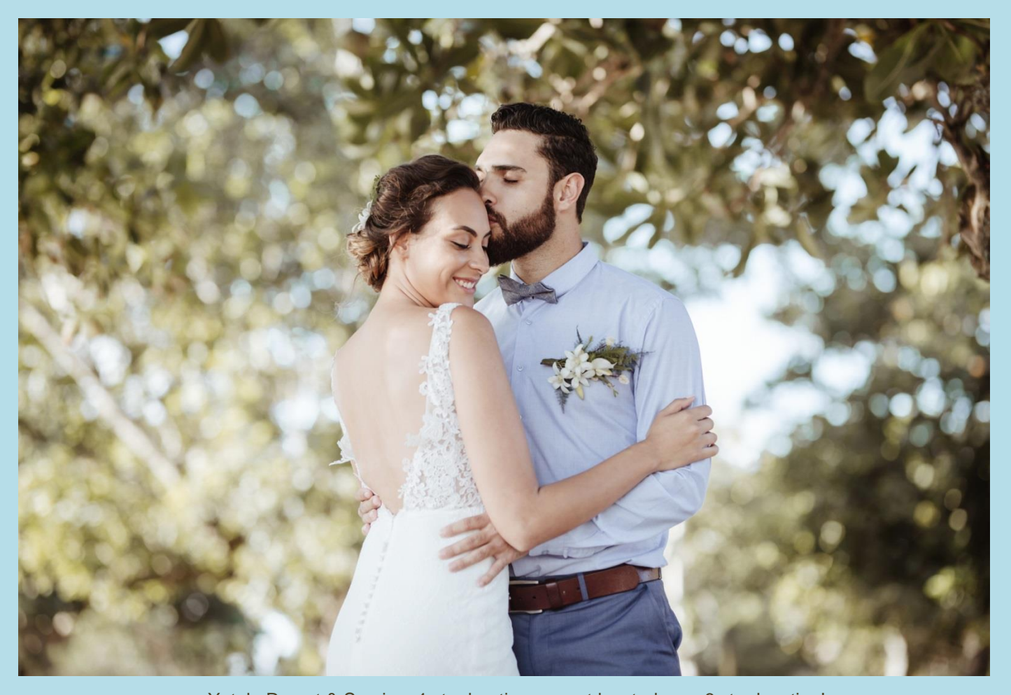
Yatule Resort & Spa is a 4 star boutique resort located on a 6 star location!

Discover a tropical beachfront paradise on Fiji's stunning Natadola Beach. Within an hour from the Nadi International Airport you will have your feet in white sand and overlooking the beautiful blue waters of Natadola Bay, regarded as one of the world's finest beaches. All rooms are only steps to the beach depending on how quickly you want to get there! For the wedding of your dreams, picture the pristine white sands of Natadola Beach with a perfect sunset and attentive staff. We take care of every detail to make your day truly special. Your guests will enjoy every aspect of their stay with comfortable resort facilities and a huge range of local attractions. Therefore if it is your wedding or your honeymoon rest assured that our wonderful staff at Yatule Resort and Spa Natadola Beach will take care of your needs.