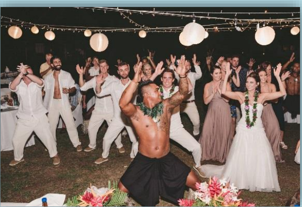
Reception Fairy Light upgrades from F$180 for extra 100m fairly lights or festoon boarder/ Below Wedding Ceremony Arch Upgrades available from F$250